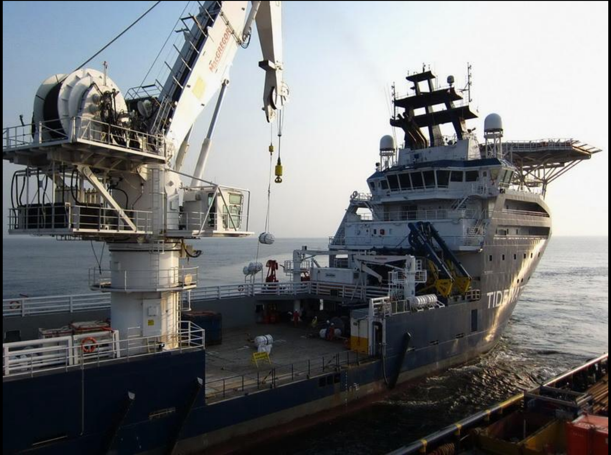
The Bourgeois Tide is alongside the Tidewater Enabler, preparing to receive two life rafts.