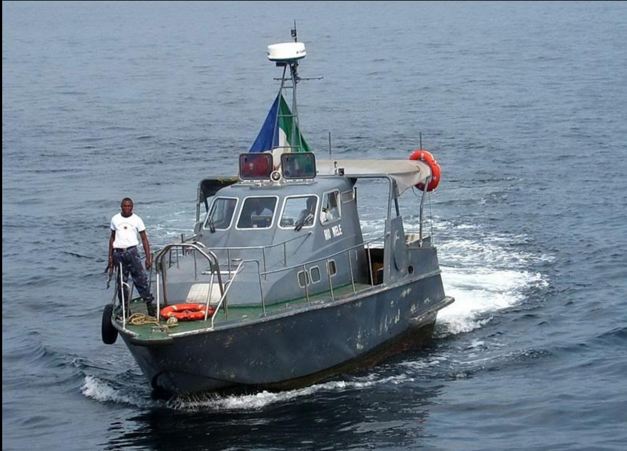
The Coast Guard, armed with AK-47, coming to tell me that the Enabler must not transfer to us using his crane in the anchorage. What a way to start your day out with a bang, not to mention overkill.