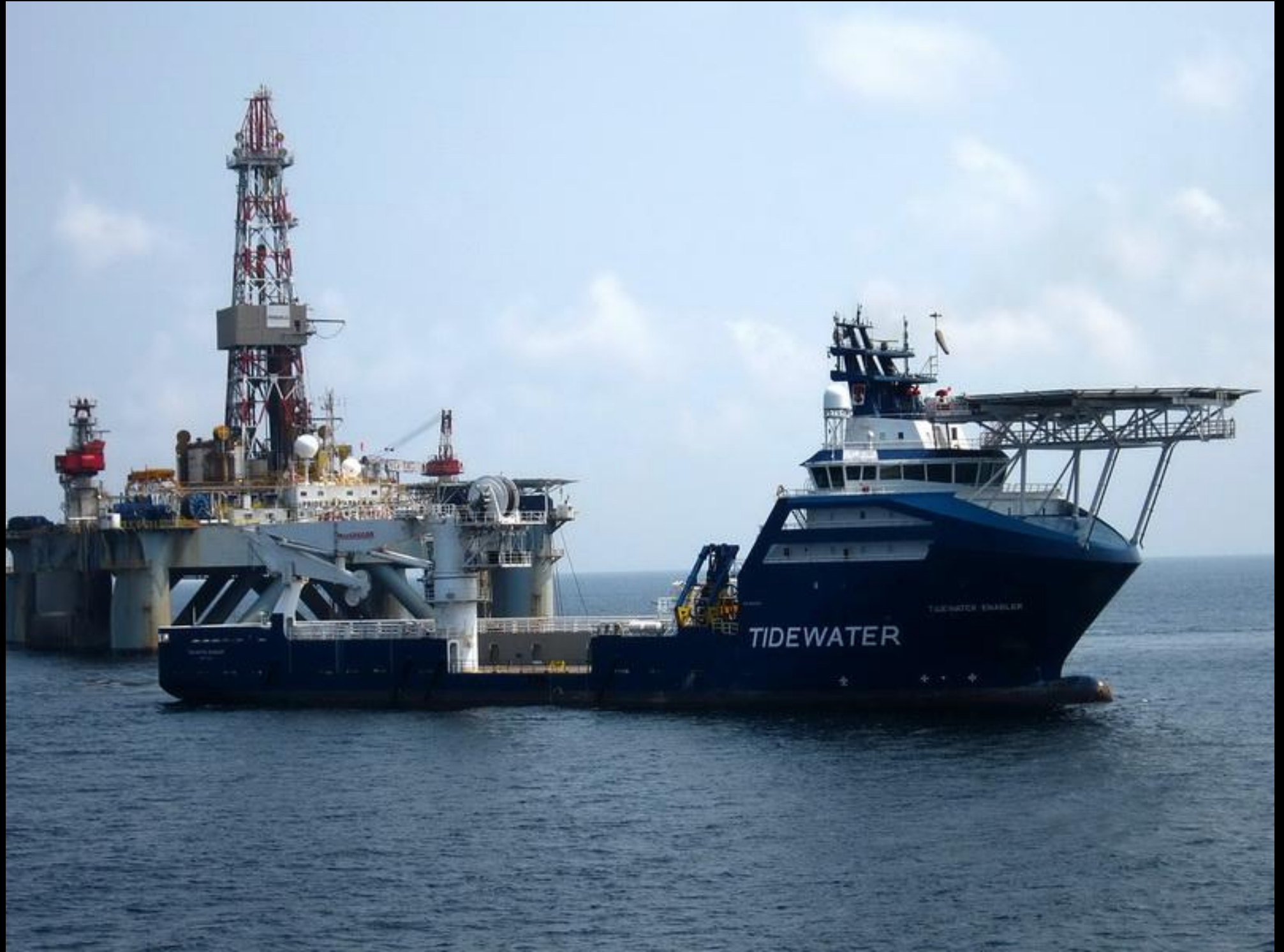
The Tidewater Enabler leaving the rig. Too bad it wasn't a little less hazy and a lot sunnier.