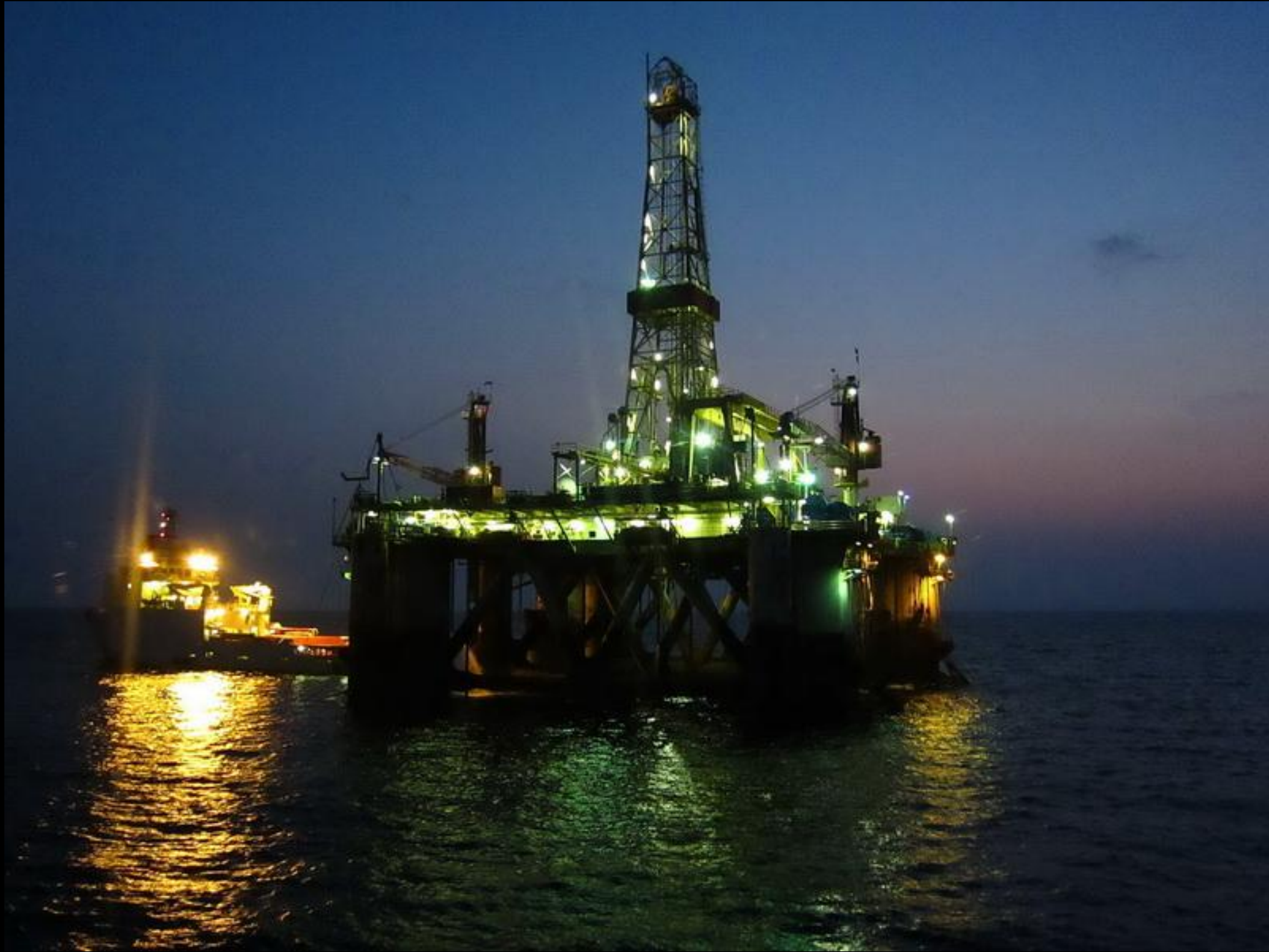
My new camera is better than expected at low light. I should have some fun with this feature.