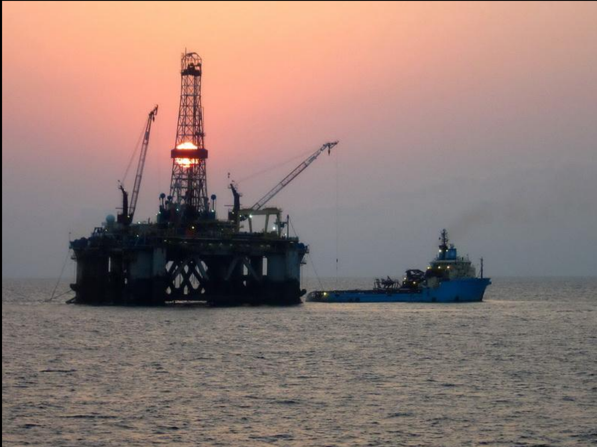
The sun "stuck" in the drill tower of the Atwood Hunter. She is preparing for a rig move.