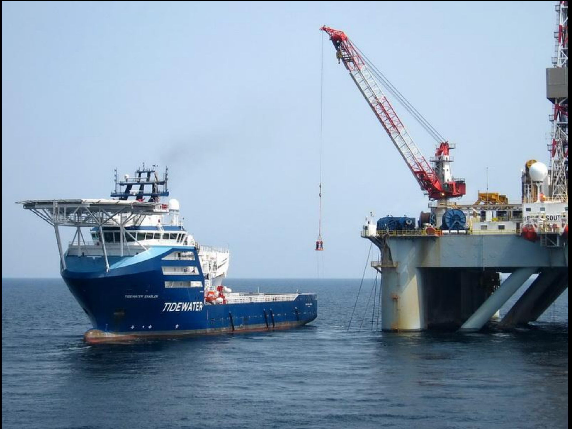
Personnel are being transferred from the Pride South Pacific to the Tidewater Enabler. Riding the personnel basket is a lot more fun than it looks!