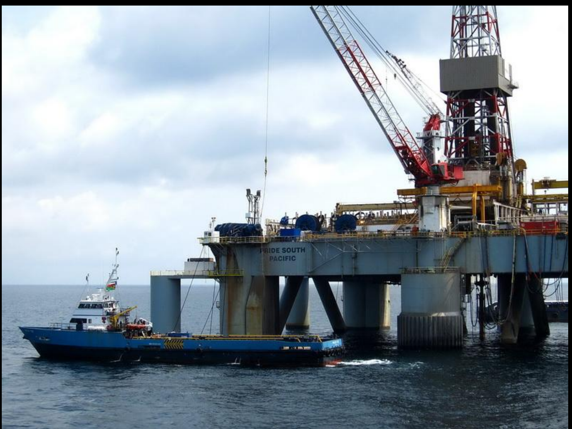
The Maslenny Tide, a Fast Supply Vessel, is an oversized crew boat at 175 feet in length. She has dynamic positioning computers. She has four propellers at the stern and a drop down Z-drive bow thruster.