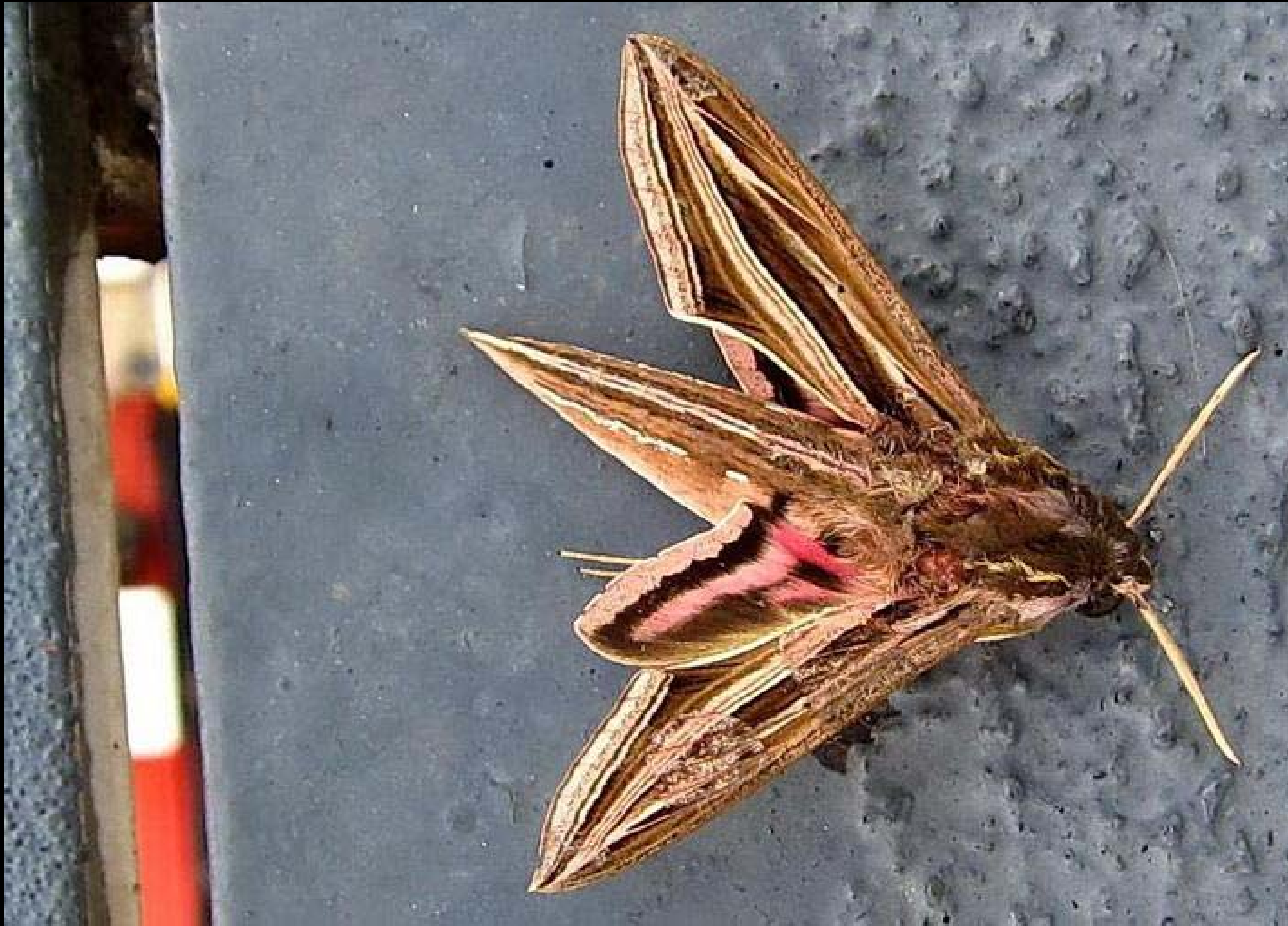
Here's another delta wing, camouflaged bug, this time in Equatorial Guinea. At 4 inches he was considerably smaller than the 9 inch green one in Cameroon.