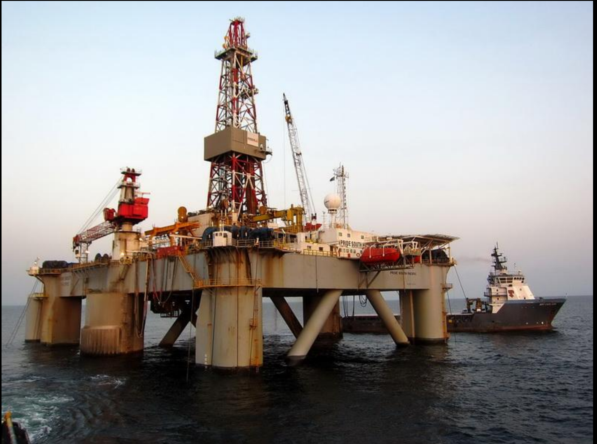
You can see the Art Carlson, a VS-480, working the Pride South Pacific semi-submersible drill rig. The VS-480's are our second largest boats. We have eight of them.