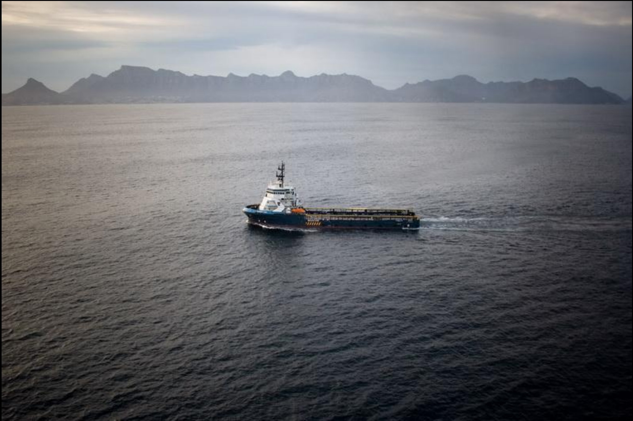
The Gubert Tide is passing the Twelve Apostles Mountain Range in Cape Town, South Africa.