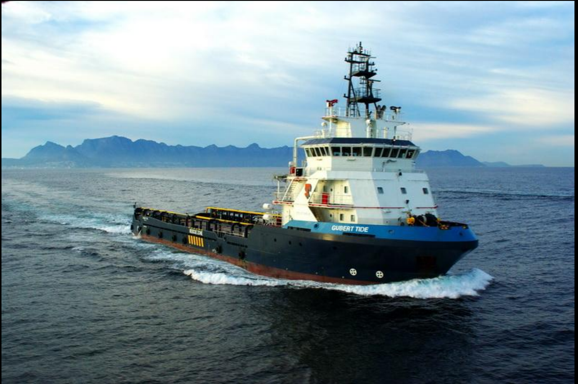
The Morning sun provides interesting lighting.