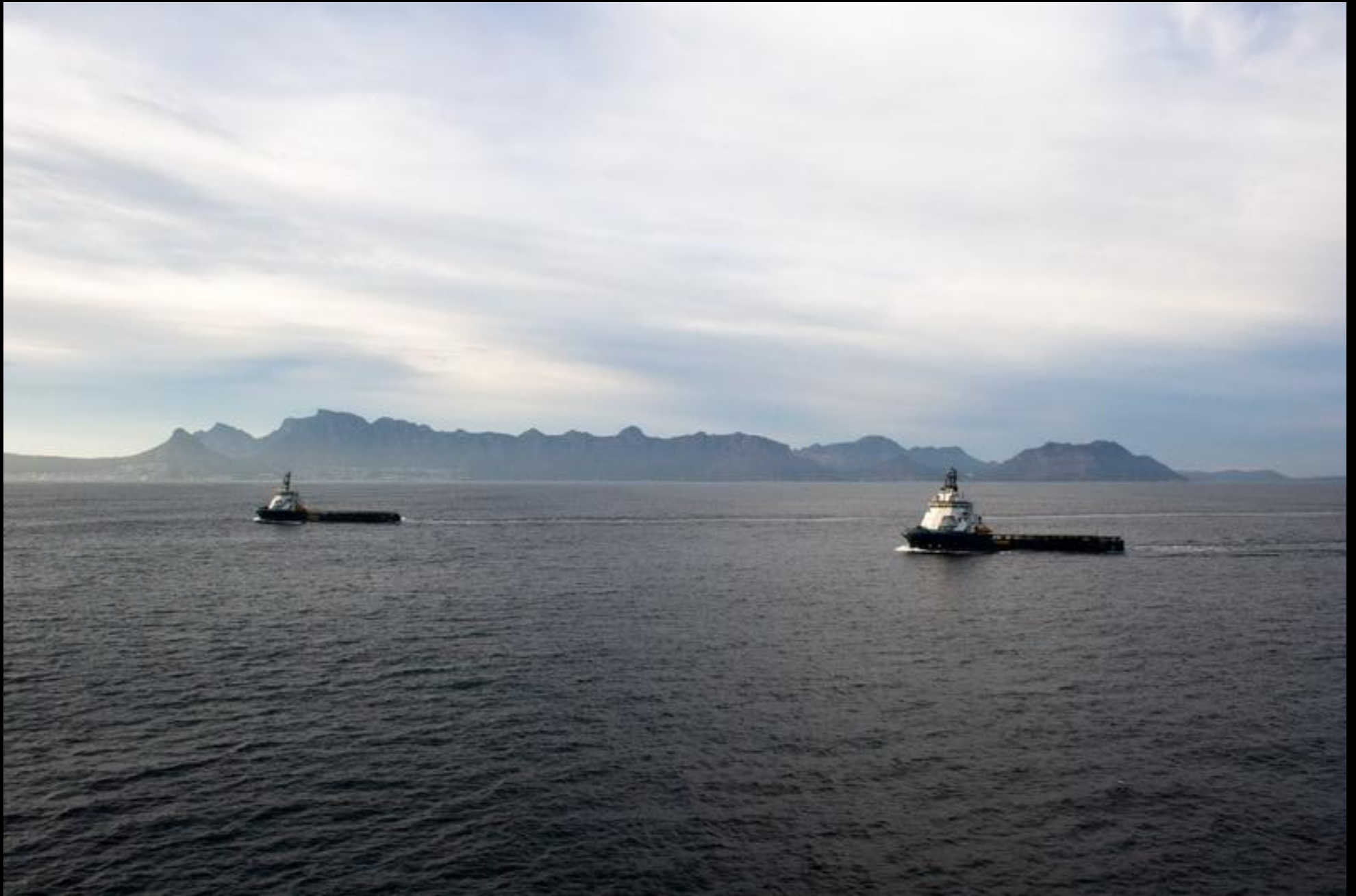
The Desoto Tide would not come close enough for a good photo, but here is one of both ships.