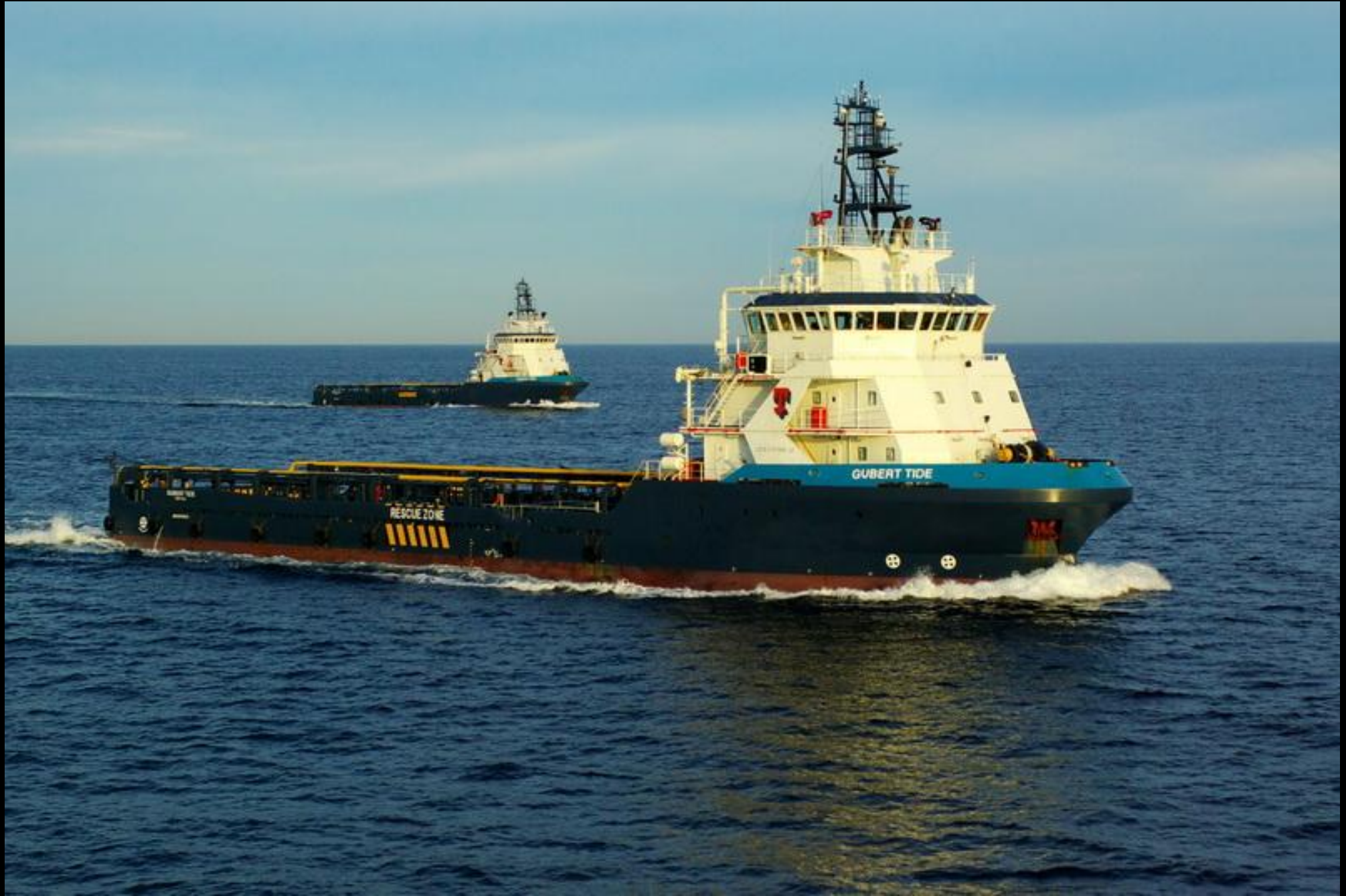
A bit different angle