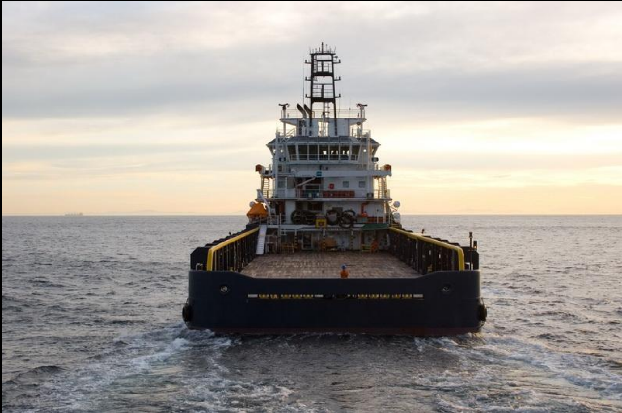
The helicopter was low to the water for this shot.